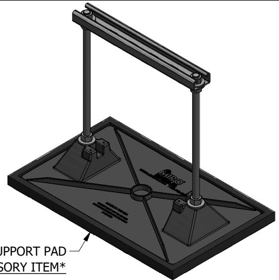
9" x 15 1 / 4 " SUPPORT PAD *ACCESSORY ITEM*